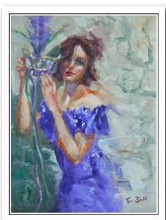
Mardi Gras Memories 2 16x12 oil