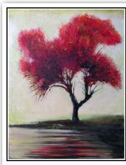
Still Water Red Reflection, 48x36