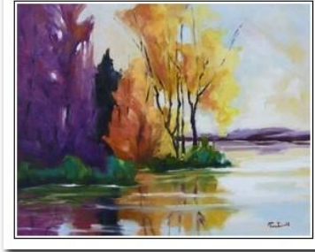
Turning River 16x20 oil