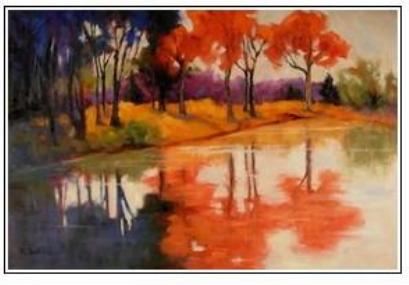
River Drama 30x44 oil