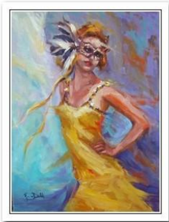
Golden Girl 16x12 oil

Color Me Beautiful Collection by Fran Dodd