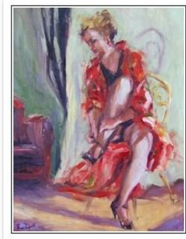
Night on the Town 20x16 oil