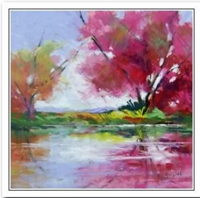
Spring on the Arkansas 12x12 oil